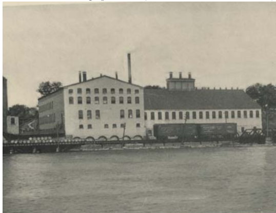
Kimberly, Clark and Company partnered with Minnesota investors to own the Atlas Mill in Appleton.